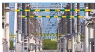
Digital Twins & Visualization