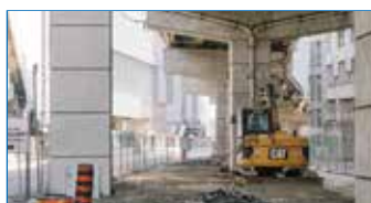
Architecture & Construction