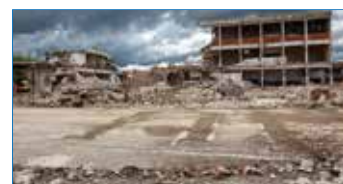
Emergency Response & Rapid Mapping