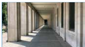
Infrastructure & Corridors